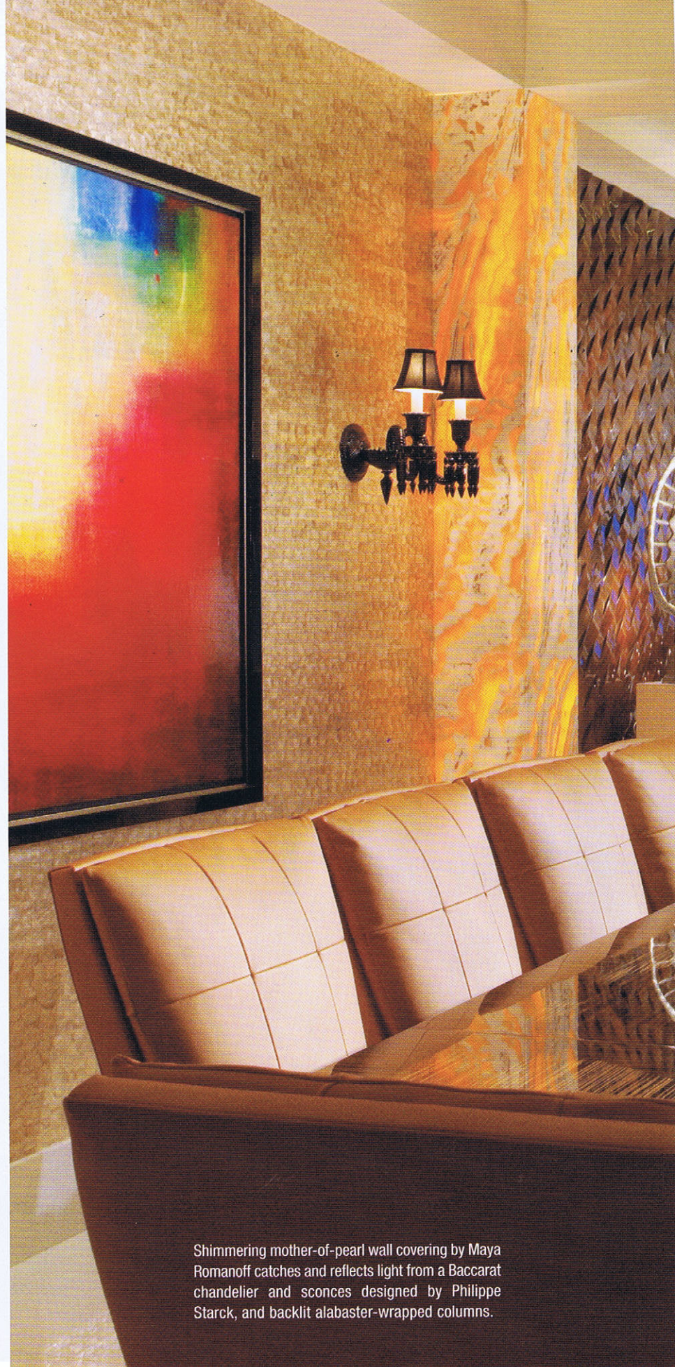
Shimmering mother-of-pearl wall covering by Maya Romanoff catches and reflects light from a Baccarat chandelier and sconces designed by Philippe Starck, and backlit alabaster-wrapped columns.

An exquisite jewel-toned color palette wraps the generous space. Balancing the shimmering tones is a strategically devised 360-degree lighting plan. Backlit columns delineate the interior spaces, while Baccarat chandeliers and accent sconces, ceiling cove lighting, and recessed downlights and floor uplights illuminate the open social areas and cast guests in a flattering sun-kissed glow.