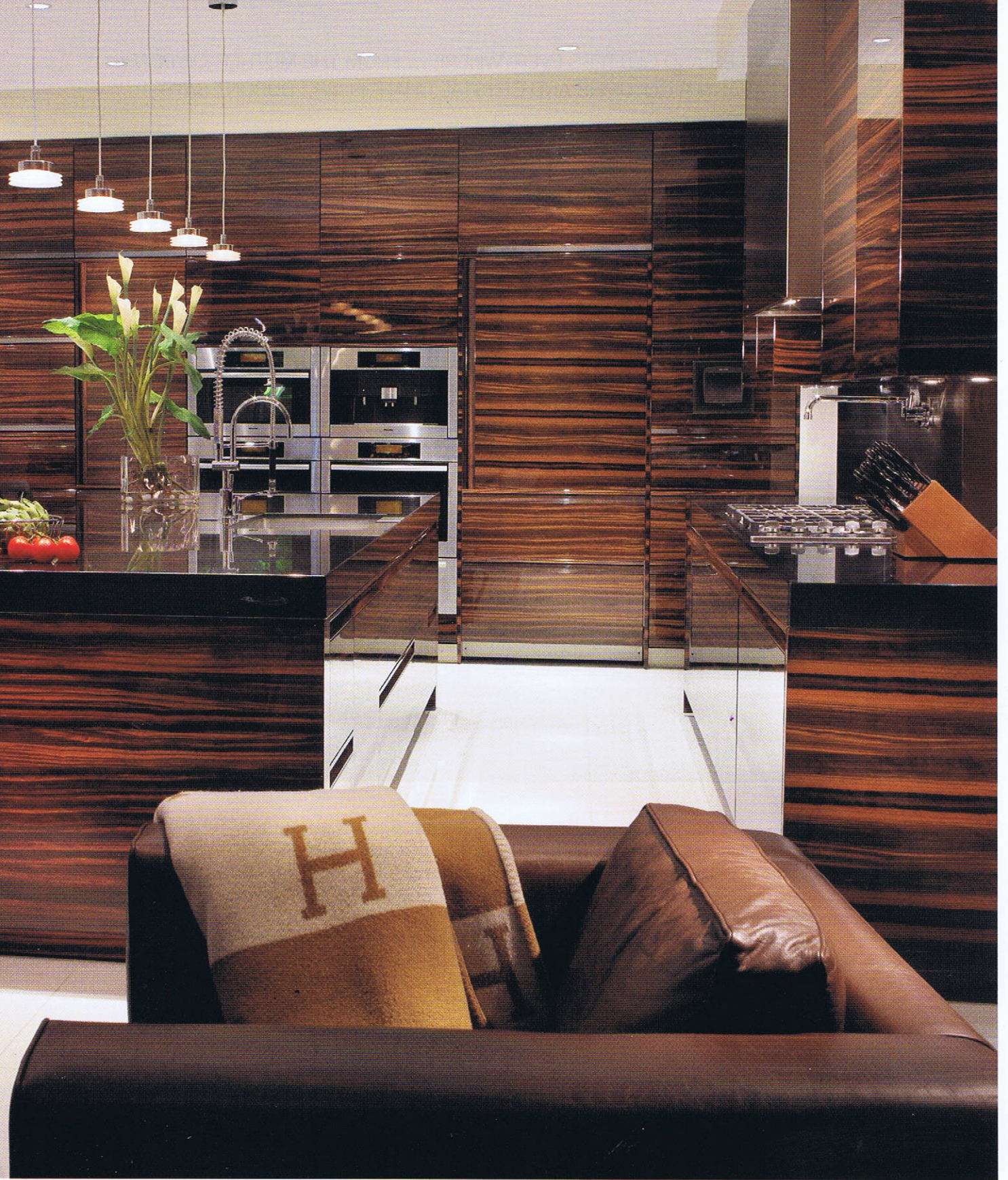
ABOVE: A small sitting area cozies up to the custom-designed kitchen, where cabinetry topped in black absolute granite houses a Miele cooktop and double ovens. Counter stools cushioned in Spinnbeck leather and an embossed crocodile-leather club chair invite a few minutes of relaxation pre- or post-party.